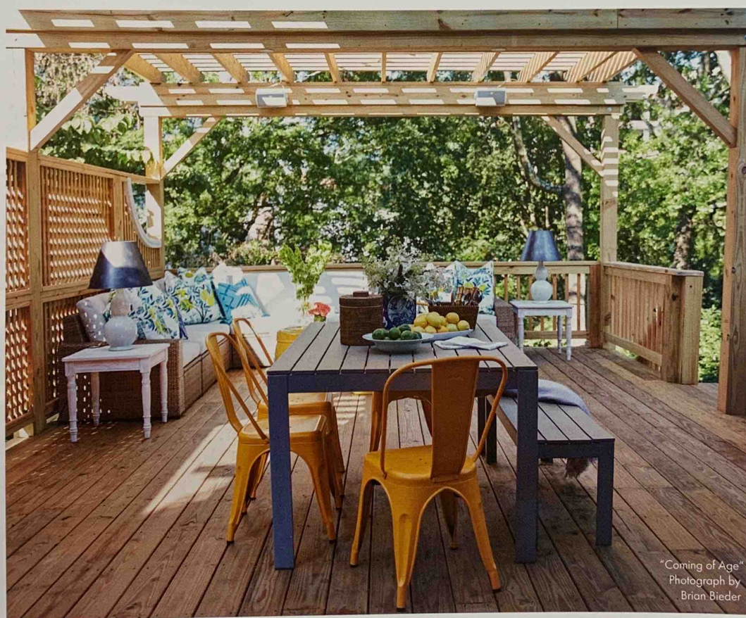
"Coming of Age"